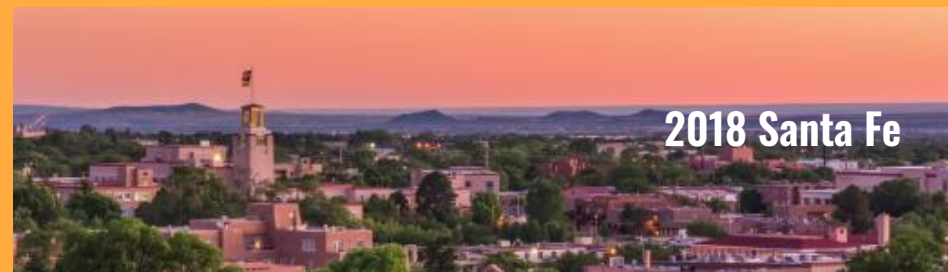
2018 Santa Fe