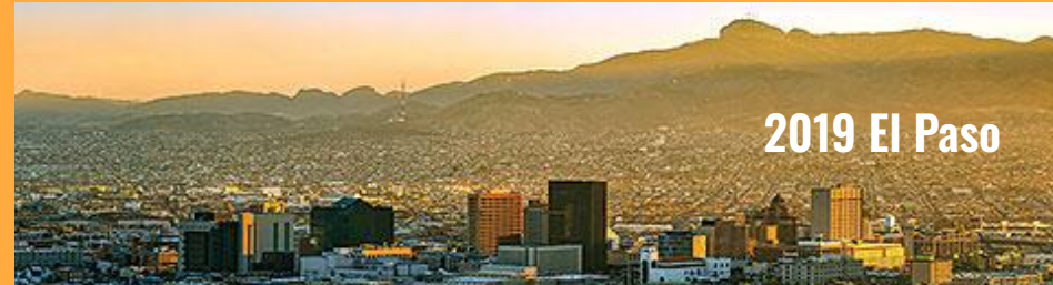
2019 El Paso