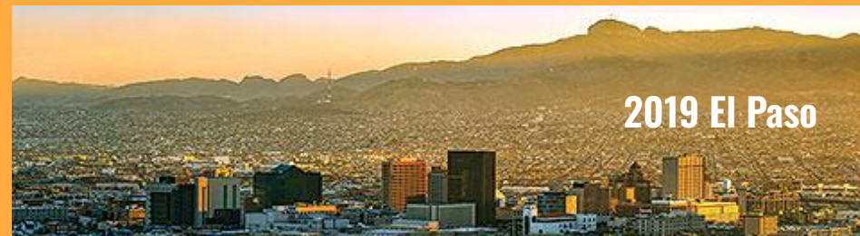
2019 El Paso