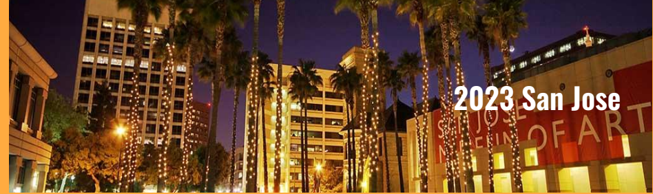
2023 San Jose