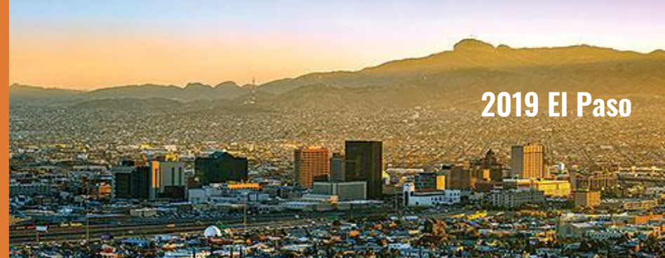
2019 El Paso