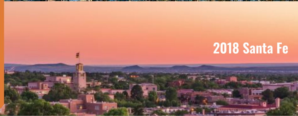
2018 Santa Fe